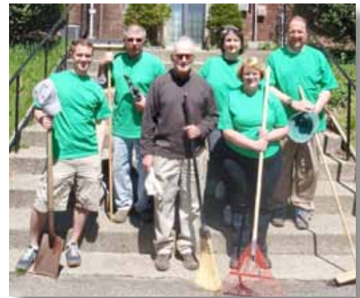
Volunteers from the Notre Dame Club

on several projects with us at various Astor locations over the years and we are continually thankful for all they do for us!