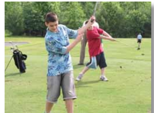
Astor Students on the golf course

They had a great day helping with the putting contest and practicing on the driving range.