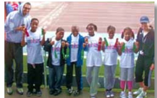
Astor children and staff

On Sunday, May 15th, a group of Astor’s Mighty Milers were invited to the New York Road Runners Youth Jamboree at the Icahn Stadium on Randall’s Island. Rain or shine, the team put forth their best efforts! Two team members won second place ribbons in the 200 and 100 meter dash, and one