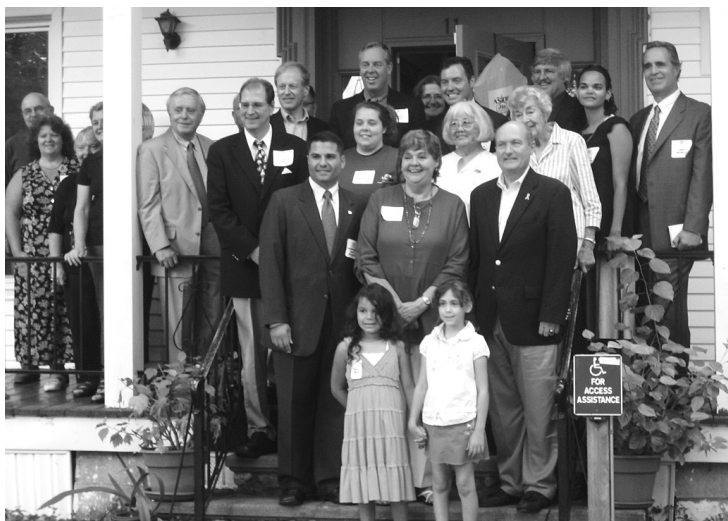
Gathering at Millerton Ceremony