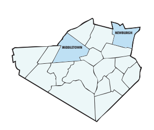
Orange County Programs