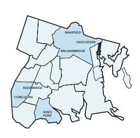
Bronx County Programs

6339 Mill Street Rhinebeck, NY 12572 (845) 871-1000 www.astorservices.org