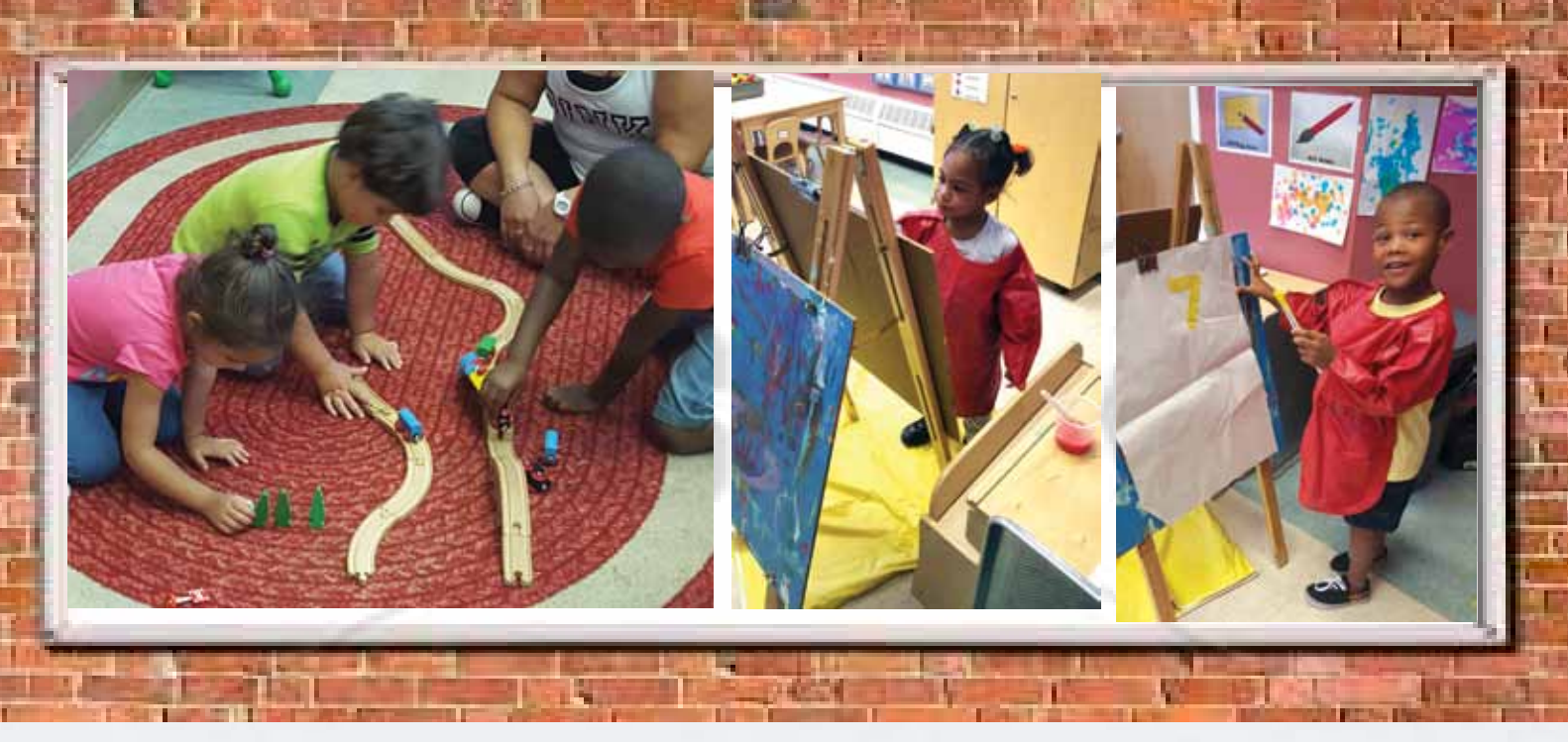
Students in the Therapeutic Nursery Program in the Bronx.

their efforts to achieve academic success. Success in school is a good predictor of social, emotional and economic success in adulthood.