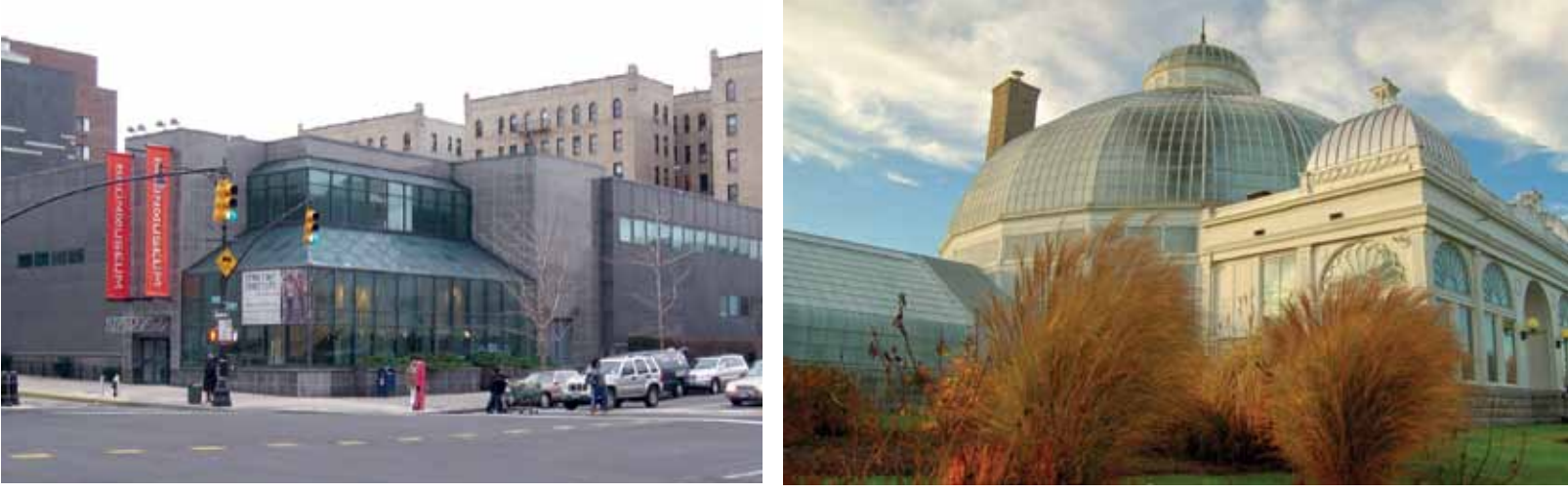
Bronx Museum of the Arts