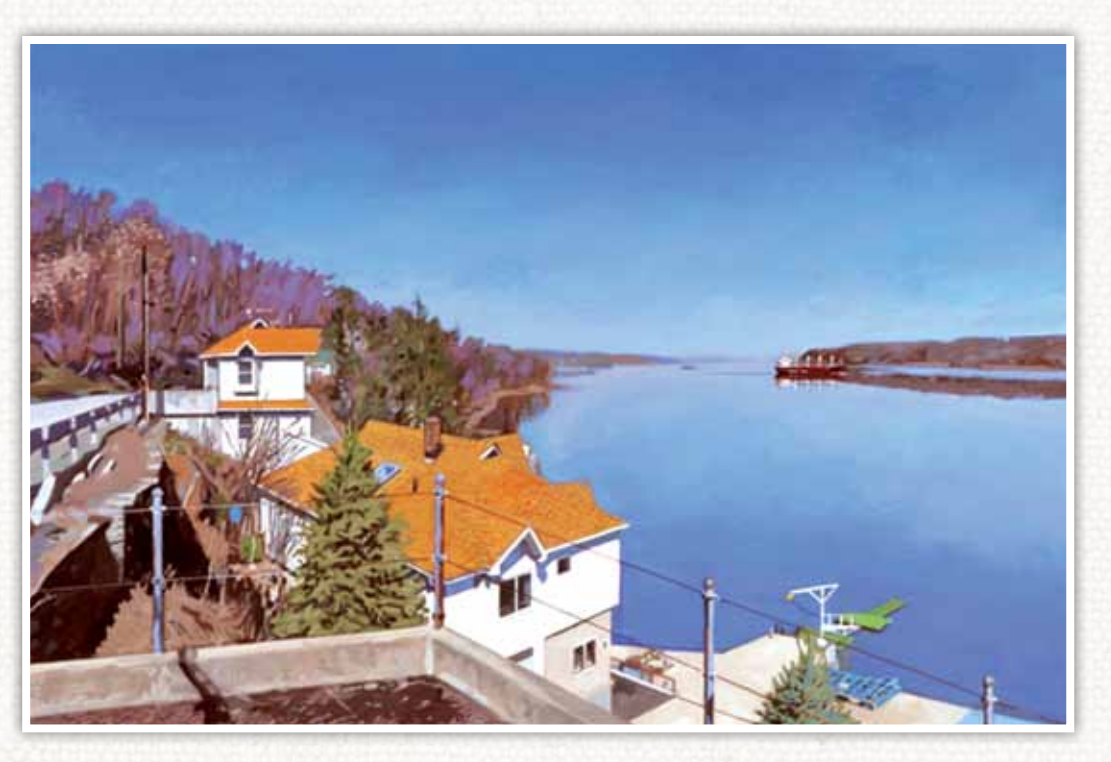
River Road Looking North by Bruce Bundock