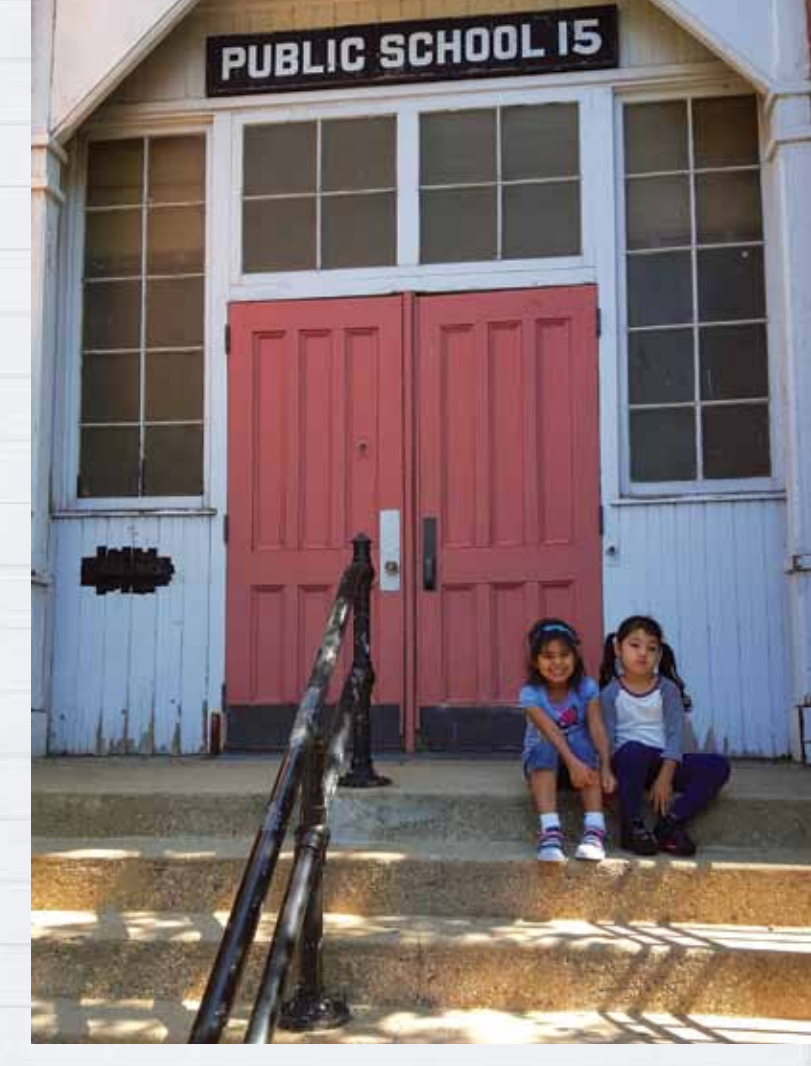
The Little Red School House

In multiple ways, in dozens of places, Astor in the Bronx is working at full throttle to provide school-based day