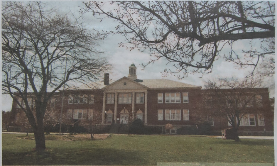
Poughkeepsie's Arthur S. May School

An ambitious new project will be breaking ground on the site of the former Arthur S. May School in Poughkeepsie later this year. While the proposed development still requires final site approval, the conditional approval granted last November is expected to be made permanent this spring.