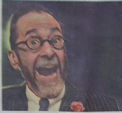
MOST DANGEROUS MAN IN AMERICA PAGE 9