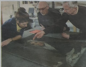
BACK IN TIME AT WILDERSTEIN IN RHINEBECK PAGE 14