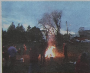
CHRISTMAS TREE BONFIRE IN RHINECLIFF PAGE 15

THIS WEEK'S WEATHER: FULL FORECAST ON PAGE 8